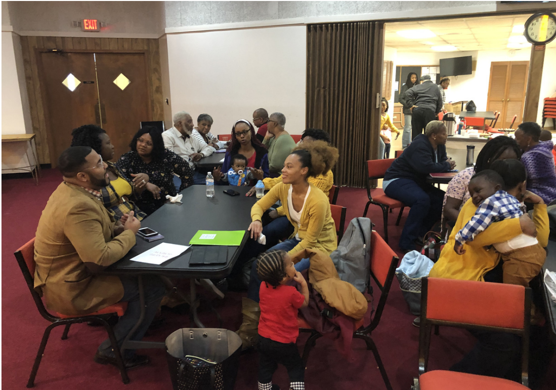
Class Leader Sunday

The monthly publication of the St. Matthew AME Zion Church